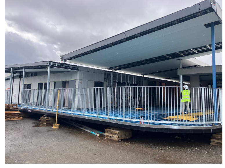
Volumetric Construction, Flood Recovery Schools, NSW Northern Rivers